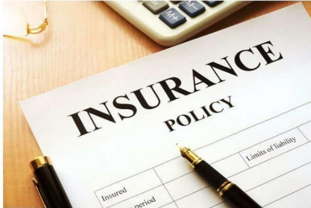
insurance, health insurance, health insurance products, health risks, IRDAI, exclusions, health insurance policies, free health check up, home treatment,